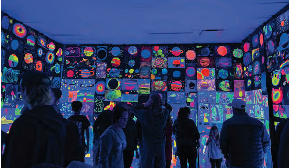
Creations by all 400 students were on display during Sunset Hill Elementary's Science Expo.