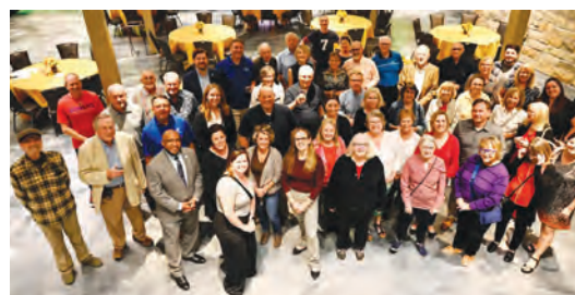
Lawrence Rotarians gathered in 2023 to pack snacks for students.

The Lawrence Rotary clubs now partner with Lawrence Schools Foundation to provide snack donations to all schools to support students who come to school hungry or need a snack during the day. In addition to its annual fall snack drive in 2023, the club